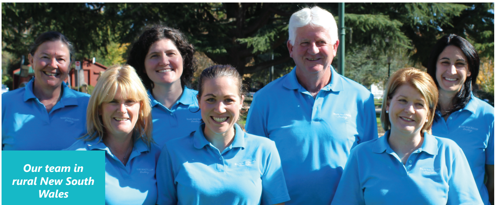
Our team in rural New South Wales

If you'd like more information you can go to www.loansmarymackilloptoday.org