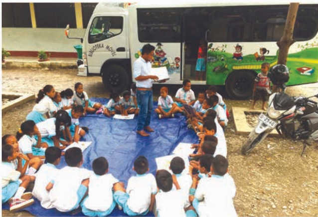
Mobile Learning Centre, Timor-Leste