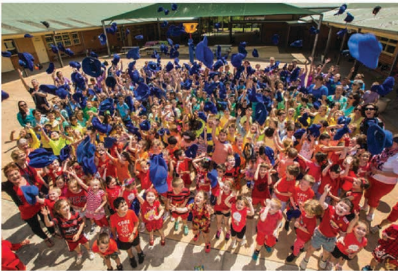
St Monica's Richmond Fundraiser 2019

Level of effort to coordinate: More of a challenge (and lots of fun)