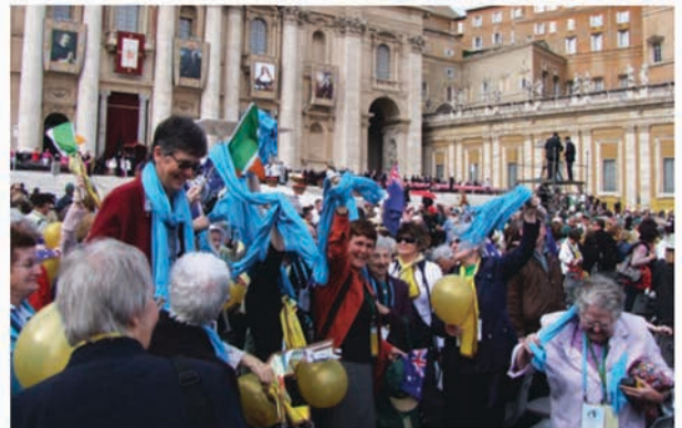
Sisters of St Joseph at Mary MacKillop's Canonisation Rome 2010

TIP: If it's tricky to find things in teal, suggest students try light blue instead.