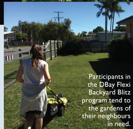
Participants in the DBay Flexi Backyard Blitz program tend to the gardens of their neighbours in need.

To gain real-life and vocational skills, the students must develop a budget for each Backyard Blitz they undertake, shop for landscaping supplies, and create promotional materials and uniforms for their gardening enterprise.